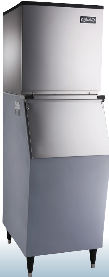
Ice maker shown on B322AP bin