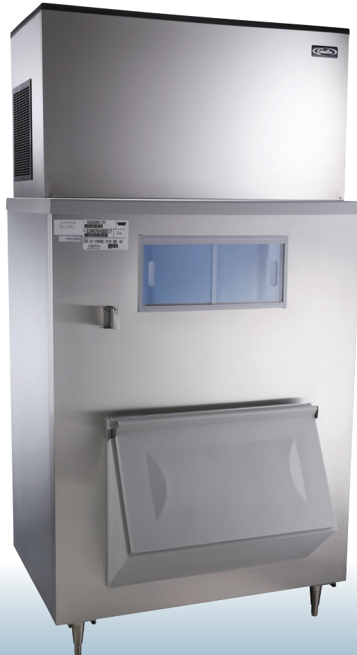
Ice maker shown on B1315SS bin